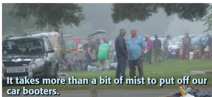
It takes more than a bit of mist to put off our car booters.

Easter Sunday, a good day to start our season of car boots. The weather forecast wasn't brilliant, but at least it said it was going to be dry. They were wrong! Stall holders had gallantly set up their sales, but with few punters, by 10am they had to start giving up. This was only the third or fourth time in over nine years that we had to abandon things. A very lucky record.