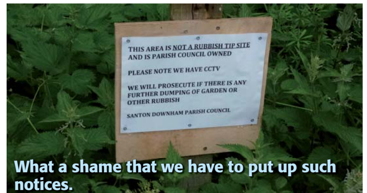
What a shame that we have to put up such notices.

However, recently some rubbish was dumped near the forest by the village hall on the edge of the track with painted timber, old flower pots and