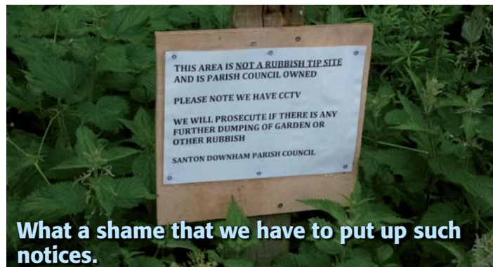
What a shame that we have to put up such notices.

However, recently some rubbish was dumped near the forest by the village hall on the edge of the track with painted timber, old flower pots and