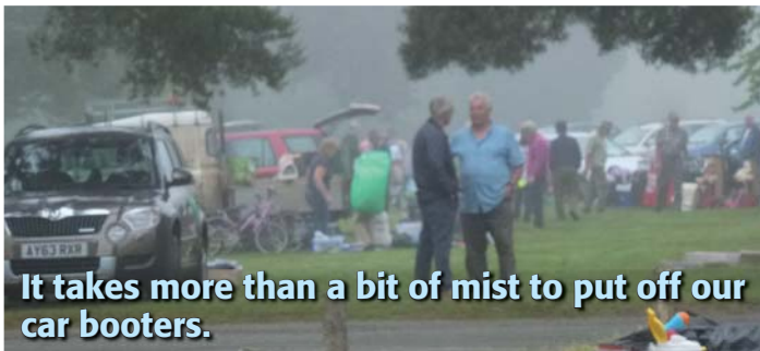
It takes more than a bit of mist to put off our car booters.

Easter Sunday, a good day to start our season of car boots. The weather forecast wasn't brilliant, but at least it said it was going to be dry. They were wrong! Stall holders had gallantly set up their sales, but with few punters, by 10am they had to start giving up. This was only the third or fourth time in over nine years that we had to abandon things. A very lucky record.