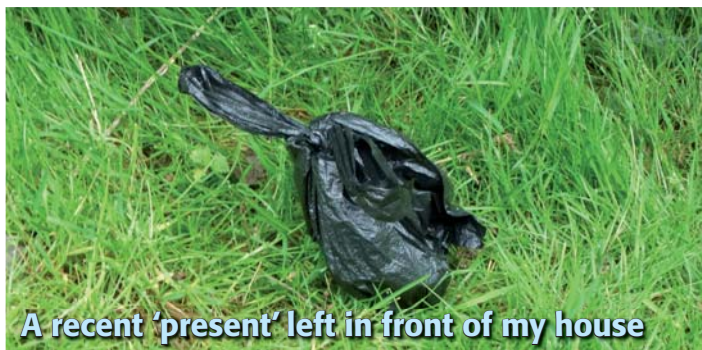
A recent 'present' left in front of my house

Oh look, someone has left me a carefully wrapped present. No they haven't, it is dog's poo in a poly bag on the verge in front of my house. Why take a poly bag to collect their dog's mess and then leave for someone else to dispose of it? I don't understand why can't people just take it home and put it in their bin.