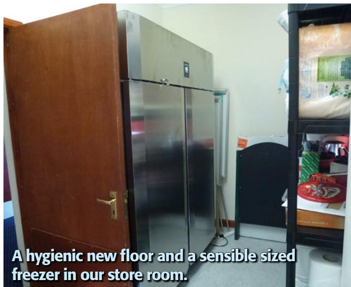
A hygienic new floor and a sensible sized freezer in our store room.

We are happy to say that some Locality Funding, available only to Village Halls, paid for at least 50% of this.