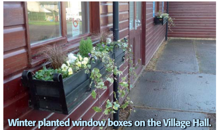
Winter planted window boxes on the Village Hall.