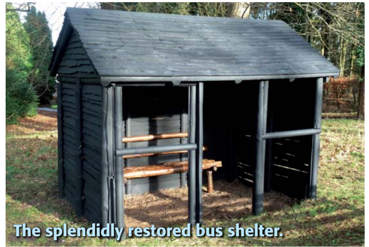
The splendidly restored bus shelter.

Well done to both of them for their superb efforts.