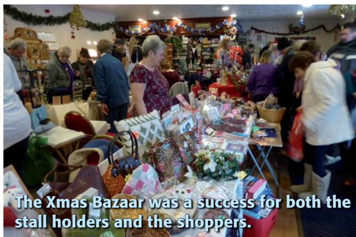
The Xmas Bazaar was a success for both the stall holders and the shoppers.

The Xmas Bazaar, held at the beginning of December was our most successful to date. The products for sale were all of a high quality and the two rooms used were packed with stalls.