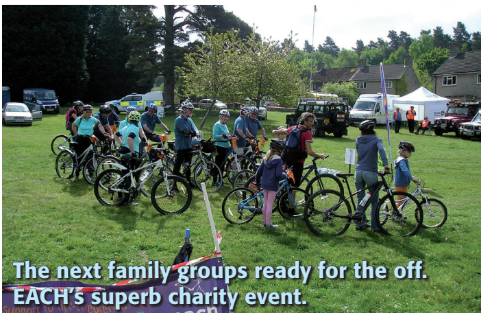
The next family groups ready for the off. EACH's superb charity event.

On a beautiful Sunday in May, almost 1,000 people turned up on the village green to take part in the annual bike ride, raising money for East Anglia's Children's Hospices. This has proved to be a superb fundraiser for a number of years. When the final monies have been collected this year's event will have raised over £50,000 – absolutely brilliant. Watch out for next year's event on Sunday 11 May – why not take part?