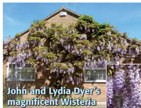
John and Lydia Dyer's magnificent Wisteria

At the time of writing, summer has arrived, although we are already using the term 'heat wave' presumably to be followed by 'drought'. Many of the villages garden flowers have survived the cold and there are some excellent specimens of Wisteria (but not mine - well frosted). Now, one last mention (probably) of our unique weather. On 11 June we were the hottest in East Anglia at 20°C. Then a friend in Northumberland emailed me to say that on their weather news Santon Downham had a huge temperature range of 1°C to 21°C in one day. On 7 July, with 28°C we were the hottest in East Anglia, and lastly, on 22 July, we were joint hottest in East Anglia with a staggering 32°C. Wow! Derek Toomer, Editor