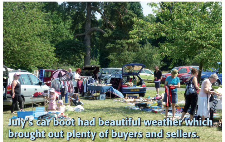
July's car boot had beautiful weather which brought out plenty of buyers and sellers.

Having resurrected our car boot sales, several years ago, they have continued to increase in popularity. Sales people and buyers seem to enjoy the scenic and more intimate atmosphere of our events compared to some of the larger ones.