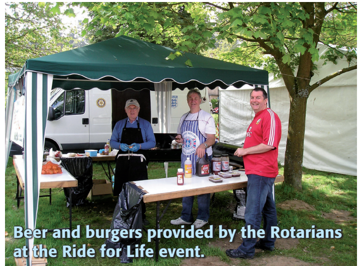
Beer and burgers provided by the Rotarians at the Ride for Life event.

Over the Ride for Life weekend, the Rotarians hosted their annual Beer Festival. A good number of real ales were available for all to sample. Alongside their beer tent, they ran a barbecue. Profits from their weekend were donated towards the cost of the toilets used for the Ride for Life.