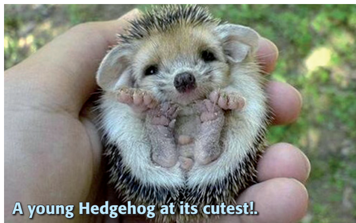
A young Hedgehog at its cutest!

We are particularly concerned with small and underweight animals or animals that are "out in daylight", behaving oddly or staggering. Whilst these animals are usually seen in Autumn, they may appear