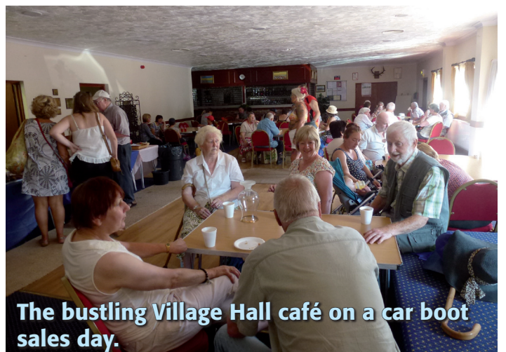
The bustling Village Hall café on a car boot sales day.

Alongside the stalls, we have been running the Village Hall café. This has also proved very popular and each car boot sees the hall buzzing with people. Bacon butties proved very popular as soon as we introduced them. This year alone, we have served well in excess of 500, bringing in good revenue towards the upkeep of the Village Hall.