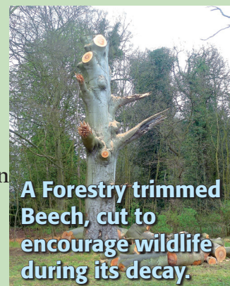
A Forestry trimmed Beech, cut to encourage wildlife during its decay.

The swing on the pine tree near the Village Hall has been well used by children. The tree survey highlighted it as causing damage to the tree. Added to this, a child was hurt on it recently. For health and safety reasons, the swing was promptly removed.