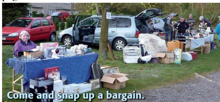
Come and snap up a bargain.

Further dates are in the 'Dates for Your Diary' on page 4.