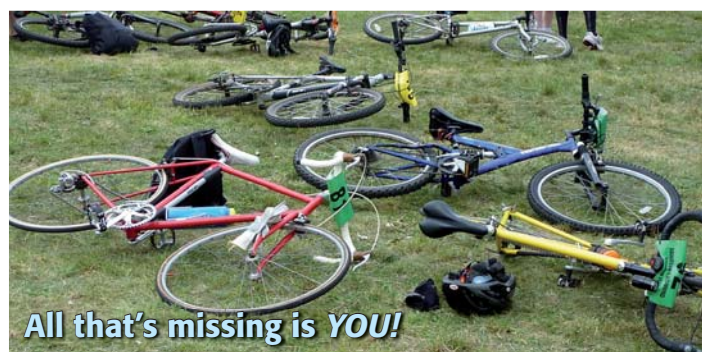
All that's missing is YOU!