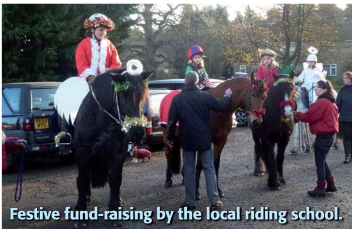
Festive fund-raising by the local riding school.

Father Christmas made his appearance, while outside the hall, the local horse riding school made an appearance in festive fancy dress.