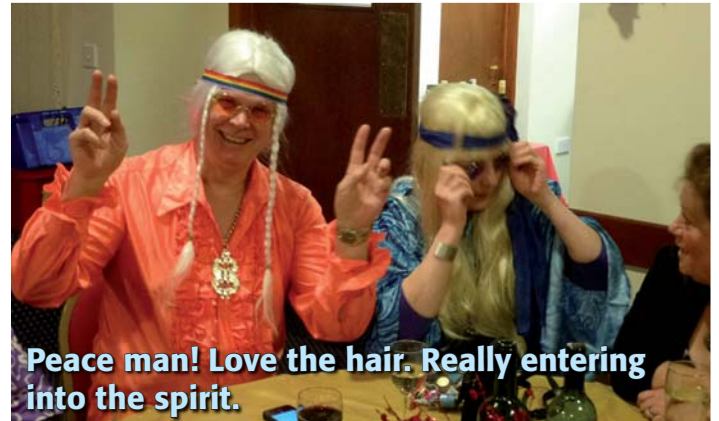
Peace man! Love the hair. Really entering into the spirit.