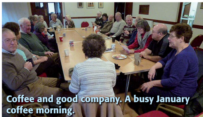
Coffee and good company. A busy January coffee morning.

Car Boot sales - these have continued to be very well supported by both stall holders and buyers.