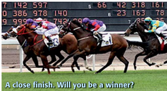
A close finish. Will you be a winner?

This is our first Race Meeting Evening, so come and make it a success. Join in our 'day at the races'. A good time is guaranteed.