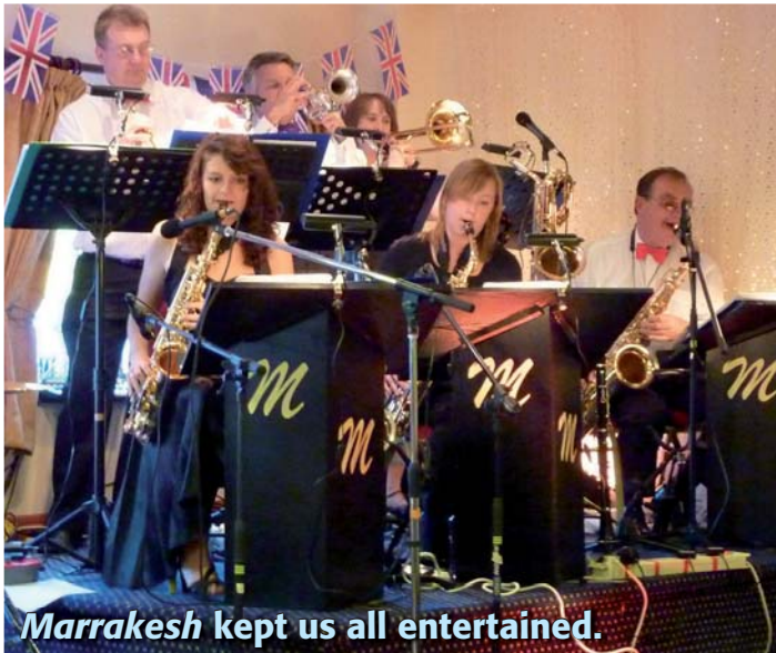
Marrakesh kept us all entertained.

July saw our third summer dance - themed as the 1940s Evening. A lively group of attendees danced to the music of a live band, Marrakesh .