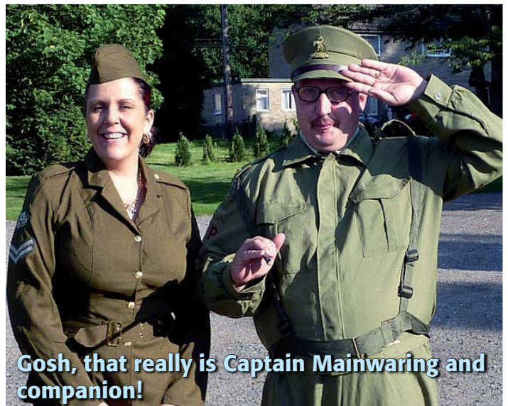
Gosh, that really is Captain Mainwaring and companion!

Money raised has gone to some local charities.