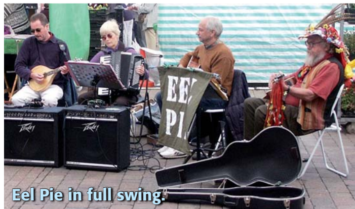
Eel Pie in full swing.