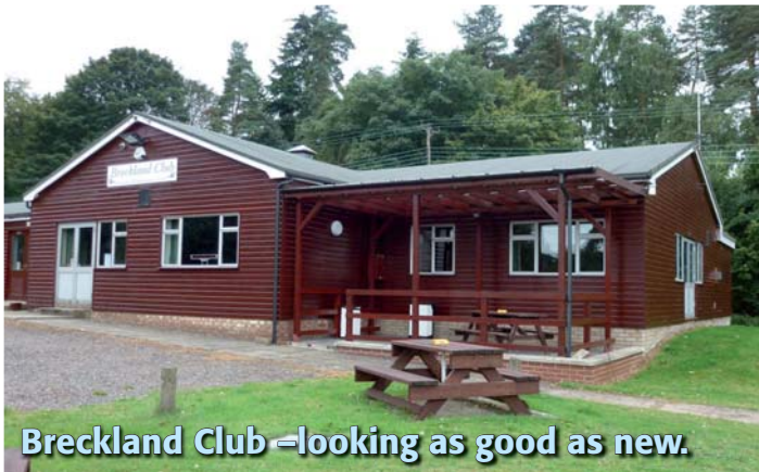
Breckland Club – looking as good as new.

Volunteers from the Breckland Club have sanded and treated the outside woodwork. A splendid effort.