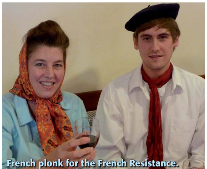
French plonk for the French Resistance.