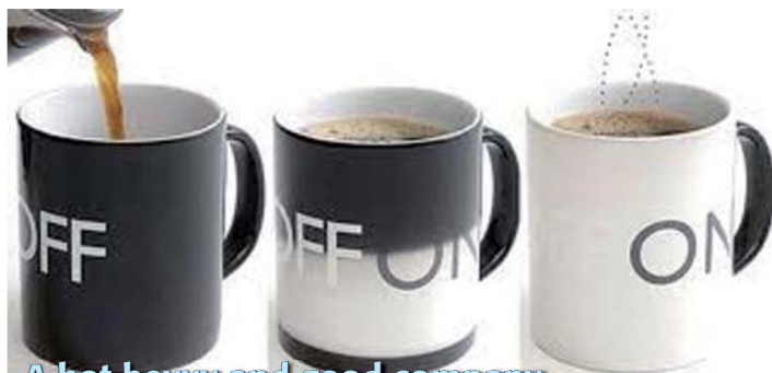
A hot bevvv and good company.

To reduce the washing up, BRING YOUR OWN MUG. Please support this new venture.