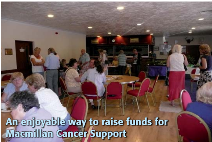
An enjoyable way to raise funds for Macmillan Cancer Support