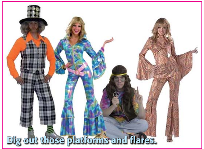
Dig out those platforms and flares.

The theme for this year's event is 1970s. We all remember the 1970s (well, if you are old enough). Totally over the top clothes and shoes. Let's see