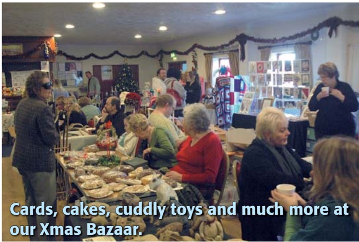
Cards, cakes, cuddly toys and much more at our Xmas Bazaar.

New year's Eve Party - Saturday 31 December at 7.30pm to 1am. Admission £12.