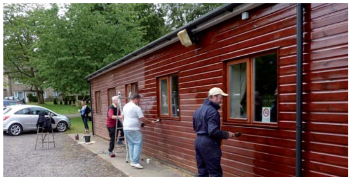
The team making rapid progress on the long front of the hall . . .

I think it is fair to say that we all thought that this was going to be quite a lengthy task. We set to as a team, sanding and varnishing. To our amazement, we had treated the whole of the hall front and side within three hours – absolutely brilliant. Thanks to all those who helped.