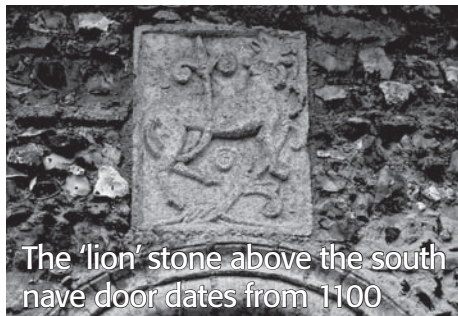
The 'lion' stone above the south nave door dates from 1100

He also suggested that the carved stone (lion) above the South Nave Door is also "circa 1100", but may have been a later addition to the outer wall.