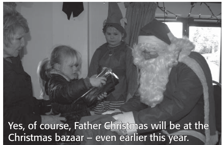
Yes, of course, Father Christmas will be at the Christmas bazaar - even earlier this year.

This year's bazaar is scheduled for Sunday 27 November - 10am to 5pm. Stall bookings were fully subscribed last year, so book early - phone 01842 815213.