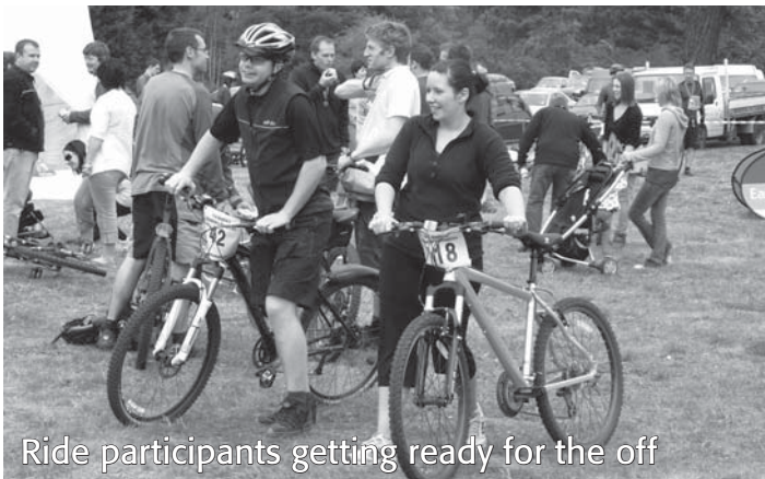
Ride participants getting ready for the off

The event raises money for EACH – Eat Anglia's Children's Hospices. Money is still coming in, but already £44,000 has been raised this year. Absolutely brilliant. Next year's ride will be on Sunday 15 May. Why not take part.