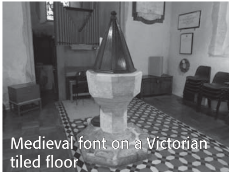
Medieval font on a Victorian tiled floor

This is a question frequently asked by local people, as well as visitors to the village. Some interior features of the church may suggest that it could be "Victorian" - the roof rafter, the floor tiling and some of the stained glass.