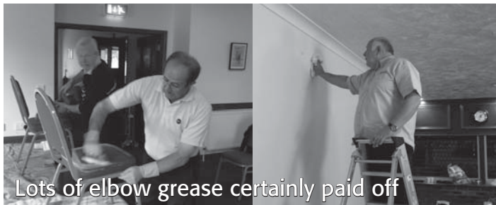
Lots of elbow grease certainly paid off

The hall chairs, carpets and walls were looking rather stained and dowdy, so members of the Parish Council and Village Hall Committee recently put in a lot of effort to clean everything. Thanks to all involved.