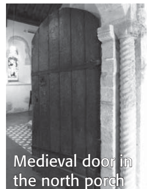
Medieval door in the north porch

The inner north porch door has a very simple appearance with equally simple hinges, but it is far older than other doors, probably dating from about 1450.