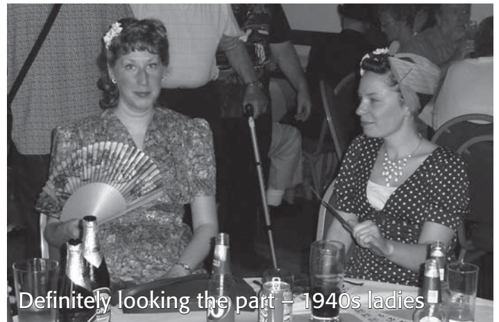
Definitely looking the part – 1940s ladies

Another very successful event, with some of the money raised going to Help for Heroes – definitely to be repeated in 2011.