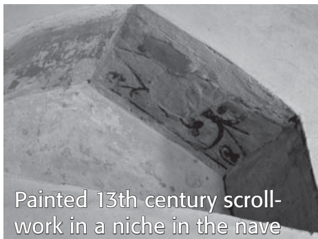
Painted 13th century scrollwork in a niche in the nave

High in the nave on the south wall, above the Mackenzie Memorial is a niche. In this niche is a small piece of dark red painting, in a scroll shape. About 10 years ago, I intercepted an