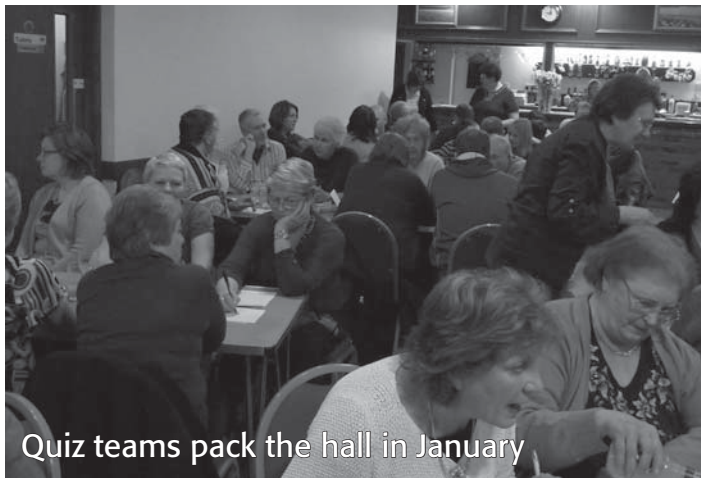
Quiz teams pack the hall in January

The next quiz in October should be just as much fun. It is likely to get booked up, so phone 01842 815213 to reserve your table. Cost is £2 per person or £7 including fish and chips.