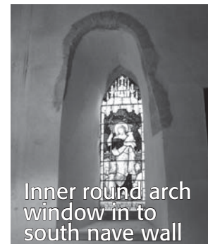
Inner round arch window in to south nave wall

There are many other interesting features in the church. The small lancet window in the south nave wall has a distinctive early round arch to the inside which has then been modified to form a pointed arch on the outside.