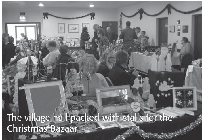
The village hall packed with stalls for the Christmas Bazaar

Early in December, the village held its Christmas bazaar. The hall was packed with stalls, with stallholders selling a wide range of items from cakes and cards to jewellery and paintings.