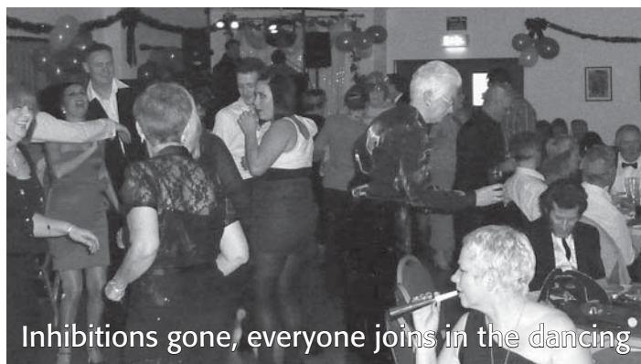
Inhibitions gone, everyone joins in the dancing

The whole evening was a pleasant, good-humoured event with people from the village and surrounding areas mixing well.