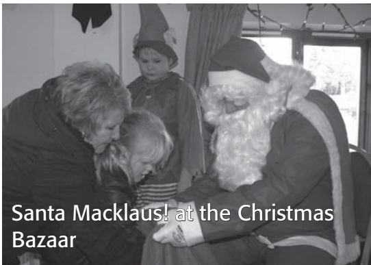
Santa Macklaus! at the Christmas Bazaar