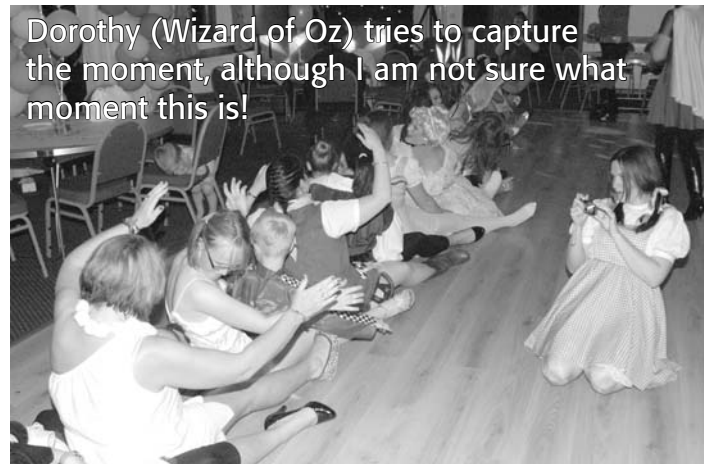
Dorothy (Wizard of Oz) tries to capture the moment, although I am not sure what moment this is!