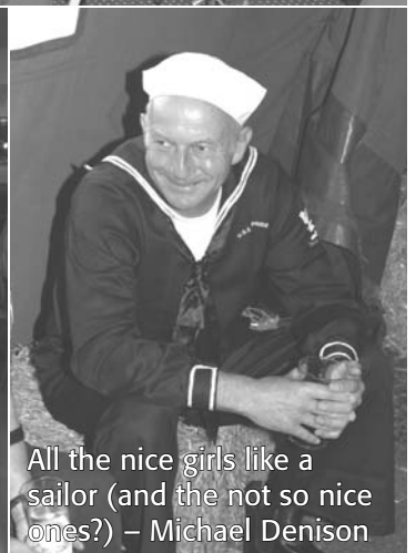
All the nice girls like a sailor (and the not so nice ones?) – Michael Denison