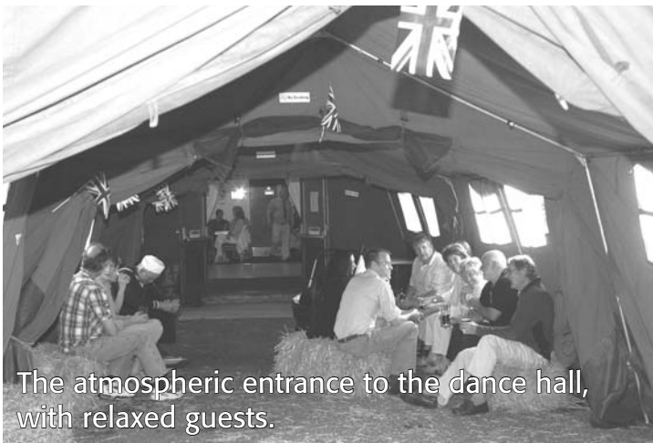
The atmospheric entrance to the dance hall, with relaxed guests.

It was all possible thanks to the hard work of a number of village residents and members of the Village Hall Committee.