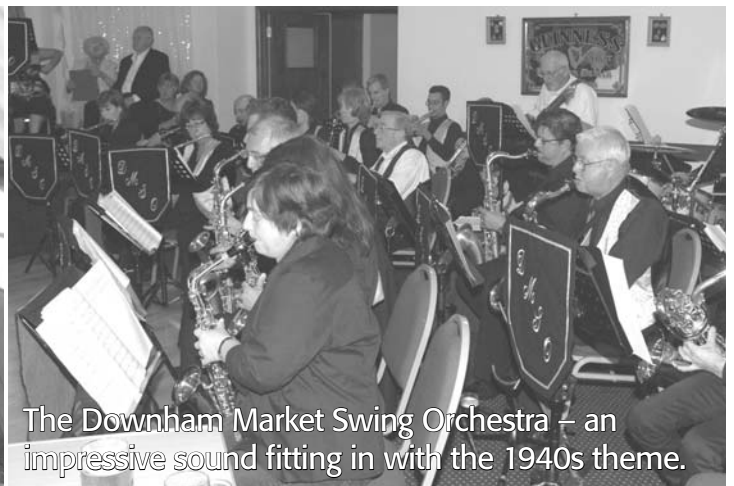
The Downham Market Swing Orchestra – an impressive sound fitting in with the 1940s theme.