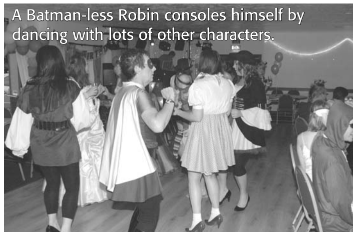
A Batman-less Robin consoles himself by dancing with lots of other characters.